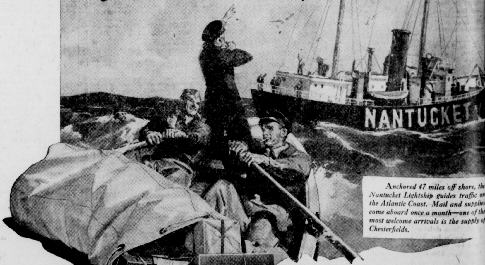
Anchored 47 miles off shore, the Nantucket Lightship guides traffic on the Atlantic Coast. Mail and supplies come aboard once a month—one of the most welcome arrivals is the supply of Chesterfields.