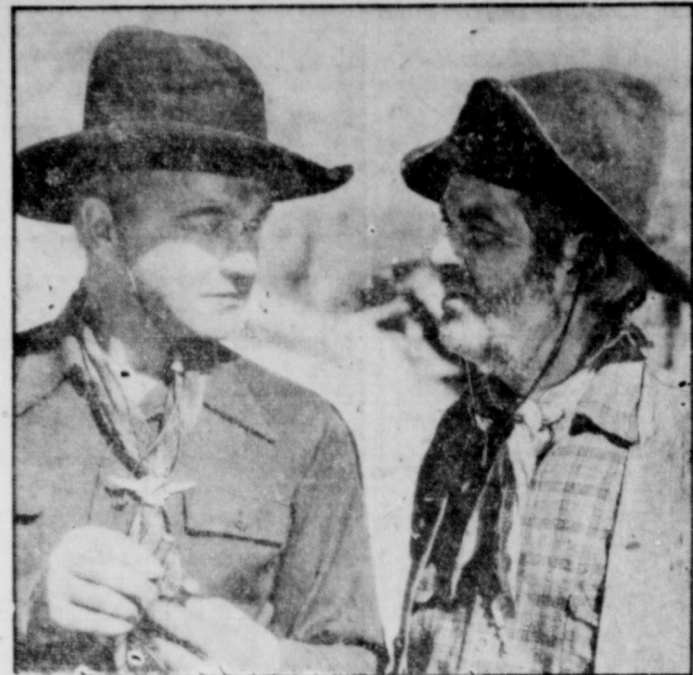
William Boyd and George Hayes in "Hills of Old Wyoming," showing Friday and Saturday at the Connellee.