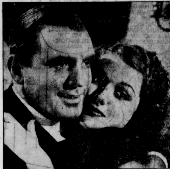
Pat O'Brien and Ann Sheridan, in "San Quentin" showing Friday and Saturday at the New Lyric Theatre.