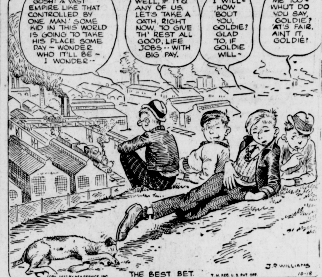
THE BEST BET

but "a man without a country." He was granted a pardon two years ago on condition he be deported. His hopes were dashed, however, by Europe's changed geography which resulted from the World War.