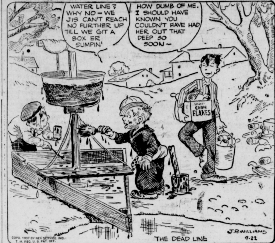
THE DEAD LINE 9-22