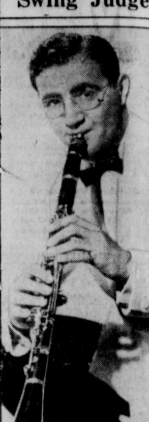
Entrants in the Swing Dance Contest being sponsored by Pan American Exposition on Sept. 17 will be judged by the king of swing himself, Benny Goodman. Out-of-Dallas dance teams are invited to enter this contest and compete for the four top prizes and $300 cash prizes. Applications should be made by mail to Publicity Department, Pan American Exposition, Dallas.