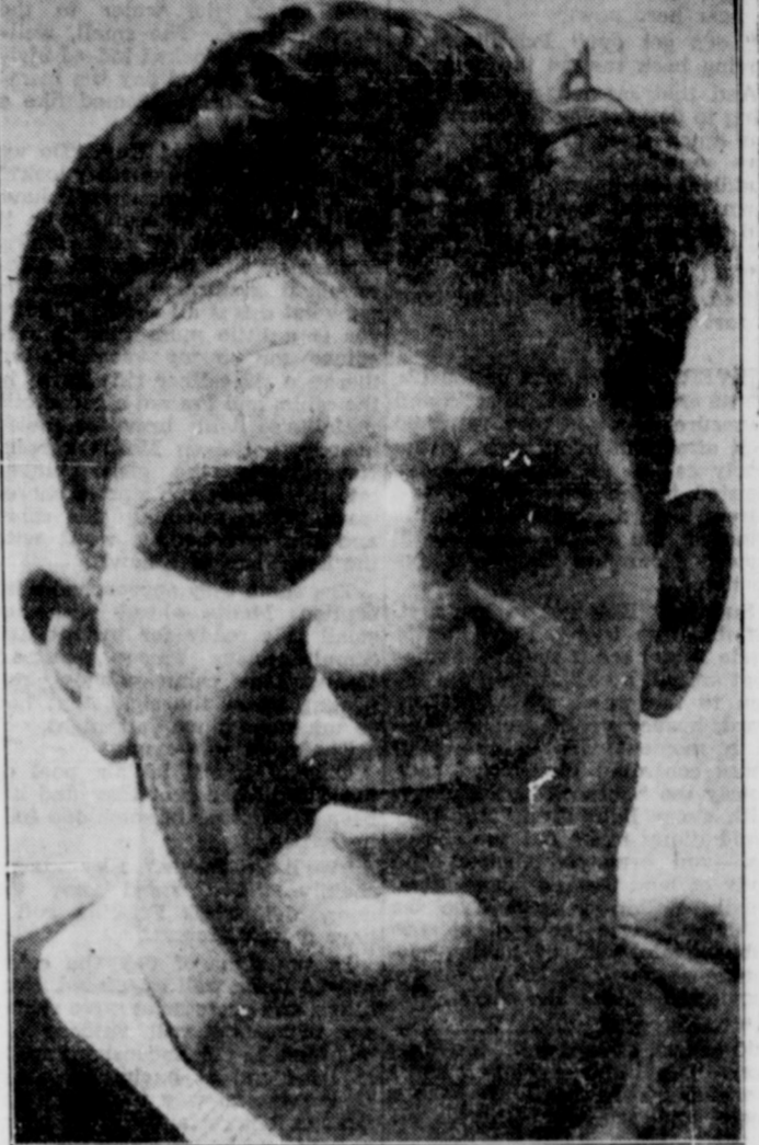
Better known as Slingin' Sam, almost unanimous all-America quarterback of 1936 while starring for the Texas Christian University Horned Frogs, this "wonder boy" from Sweetwater will be the sparkplug of the College All-Stars against the Pro Chicago Bears in the South's second football dream game Monday night in the Dallas Cotton Bowl at the Pan American Exposition.