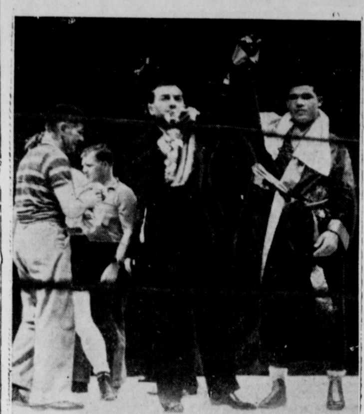
"Winner and still champion—Joe Louis!" Expressiveness, eyes oady puffed, Joe Louis, world's heavyweight champion, is proclaimed winner by unanimous decision of the three judges in his fight with Welsh Tommy Farr at Yankee Stadium, Farr, half concealed by his handlers, at left, leaves the ring where his magnificent and unexpected showing won him the enthusiastic acclaim of fight fans.