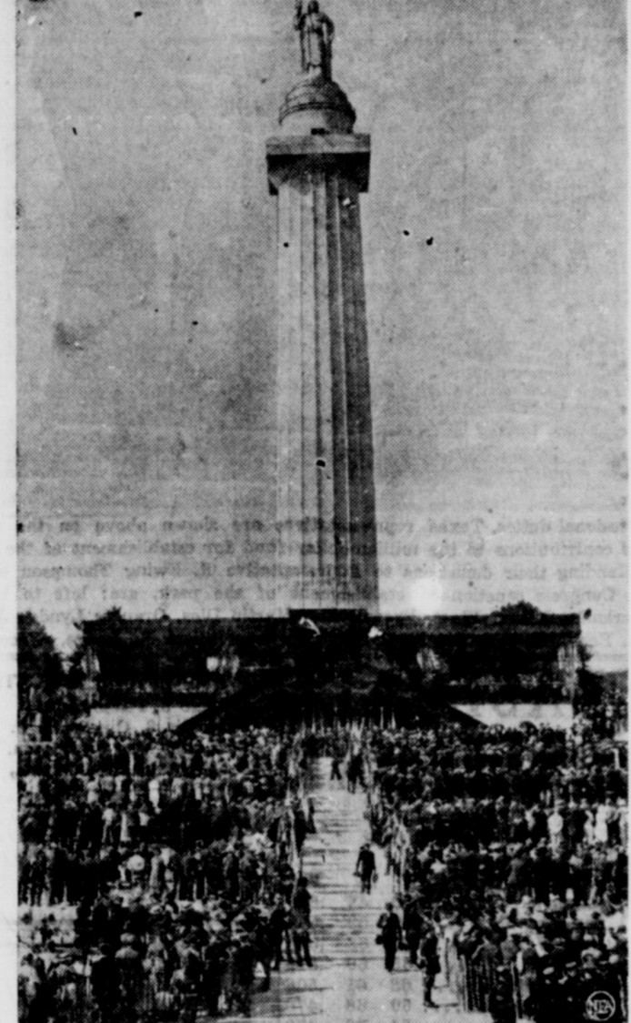
The graceful shaft of the memorial towers above the battlefield at Montaucon to the memory of 123,000 American soldiers who fell in the Meuse-Argonne offensive...