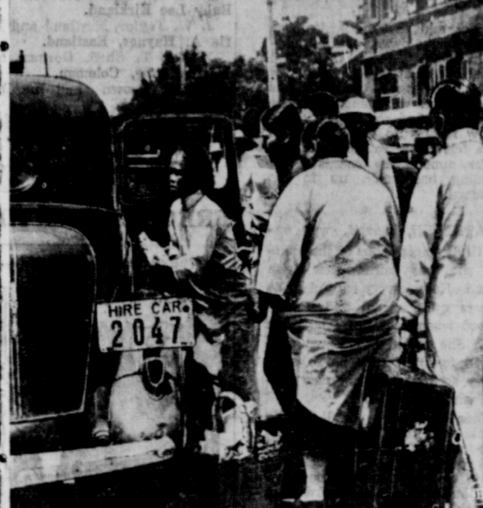
As the Japanese army knocked at the gates of Peiping with 3-inch shells, the city's means of conveyance were taxed to the limit to move refugees to points of safety. A typical Peiping family, with their most precious possessions, crowd above into a hired car (taxi) to flee from the shell-menaced capital of ancient China.