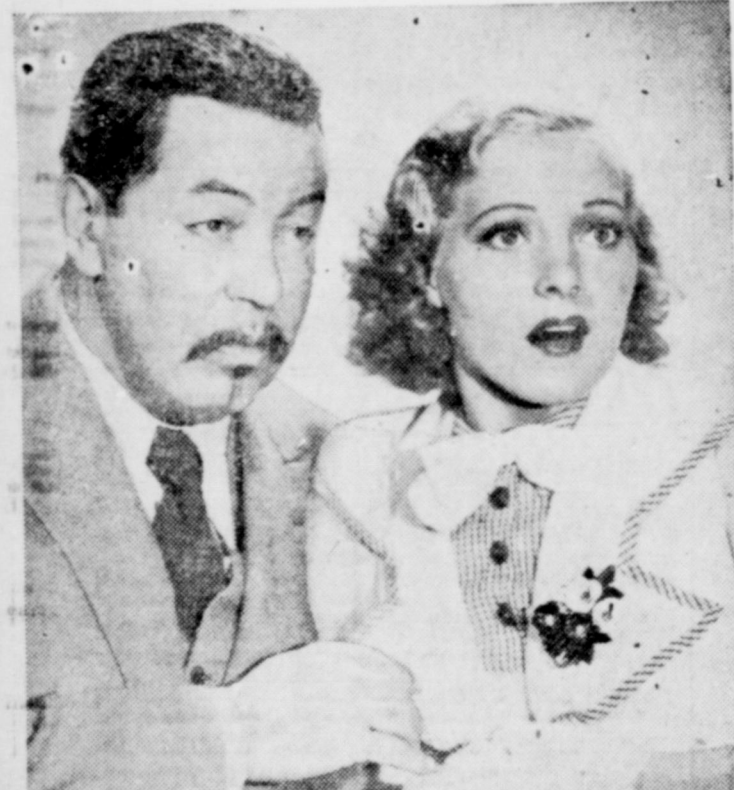
Edward G. Robinson, Miriam Hopkins and Joel McCrea form an almost tragic triangle in Samuel Goldwyn's "Barbary Coast," released through United Artists and currently at the Connellee theatre.