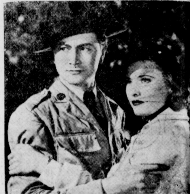
Robert Young and Barbara Stanwyck in "Red Salute," reliance's gay new romantic comedy, released through United Artists and showing Sunday at the Connellee Theatre.