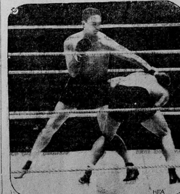
This remarkable action view of the recent Loughran-Walker fight at Chicago tells the story of Loughran's victory—a left hand that constantly worried the challenger. Loughran, left, held Walker away with his long left jab throughout the fight. Note how Loughran has his right hand cocked—he used it often during the fight—and how his left is stuck straight at walker's head. This is from the ninth round.