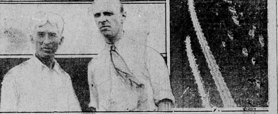
A broken steering apparatus spelled defeat for Gar Wood, American veteran of aquatic race tracks, when he pitted his trim "Miss America VII" against Major H. O. D. Segrave's "Miss England" on Biscayne Bay, Florida. Pictured here are scenes from the second day's race, when Wood finished fourth of a lap ahead of the English speed king but lost the event because of his unfortunate showing the first day. The aerial photo at the right shows the two speedboats thundering down the twelve-mile course. Wood well in the lead. Upper left, the two crafts are shown bow to bow earlier in the race. Lower left, Wood (left) congratulates Major Segrave on his victory.