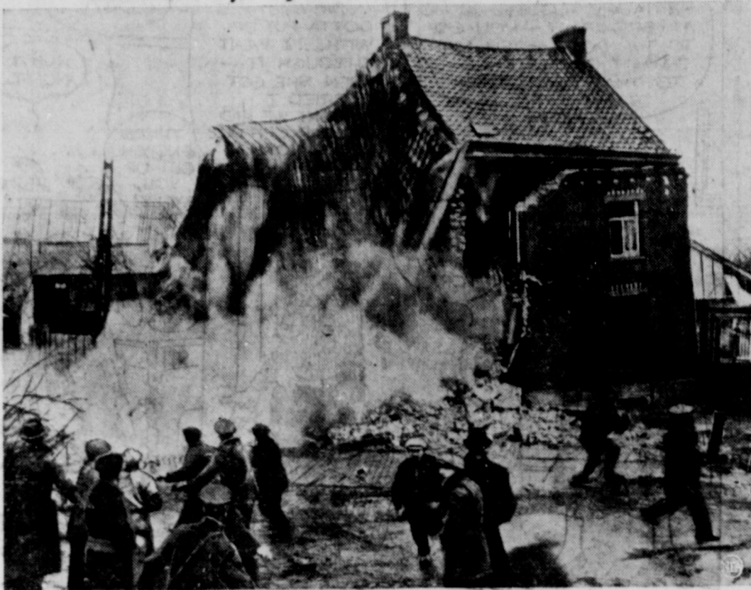
In the remarkable photograph above, the camera caught the full tragedy of a disaster that left 200 Belgians of the village of Courcelles homeless, when a subterranean landslide caused buildings to collapse without warning. Terrified passersby are shown fleeing from the sudden crashing avalanche of bricks and roof tiles.

mother, Mrs. J. B. Nunn, who is ill at this time.