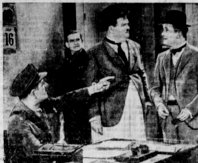
Stan Laurel and Olive Hardy in a scene from "Bonnie Scotland," coming to the Connellee Theatre today and Saturday.