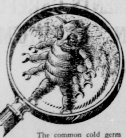
The common cold germ shows no favor. Invisible but dangerous, this Number One Enemy of Public Health skulks like a bandit of the night ready to rob you of good health.

Tune in Thursday night at 6:45, WFAA-WBAP, for vital facts to help you guard your family against Public Health Enemy No. 1