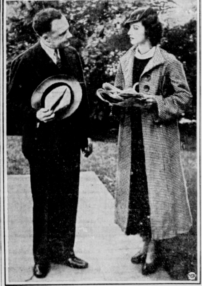
He said, "I'm on my way to a late lunch. I wonder if you will join me?"