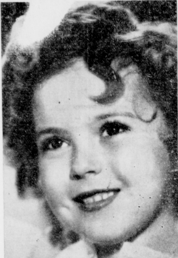
SHIRLEY TEMPLE is revealed as she really is in her sunny Fox Film production, "Curly Top." America's darling sings and dances in this happy, tuneful treat.

Boles. "Curly Top" is probably Shirley's happiest and most natural picture. Her round of songs are supplemented by new dance routines that add much to the picture.