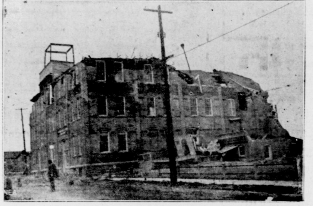
Two persons were killed, scores injured, and over two hundred industrial buildings and homes were damaged so seriously that they will have to be razed, by a severe earthquake that shook Helena, Mont., all morn'g a week of minor shocks. The above photo, shows the National Biscuit company warehouse there, its walls crumbled by the temblors.