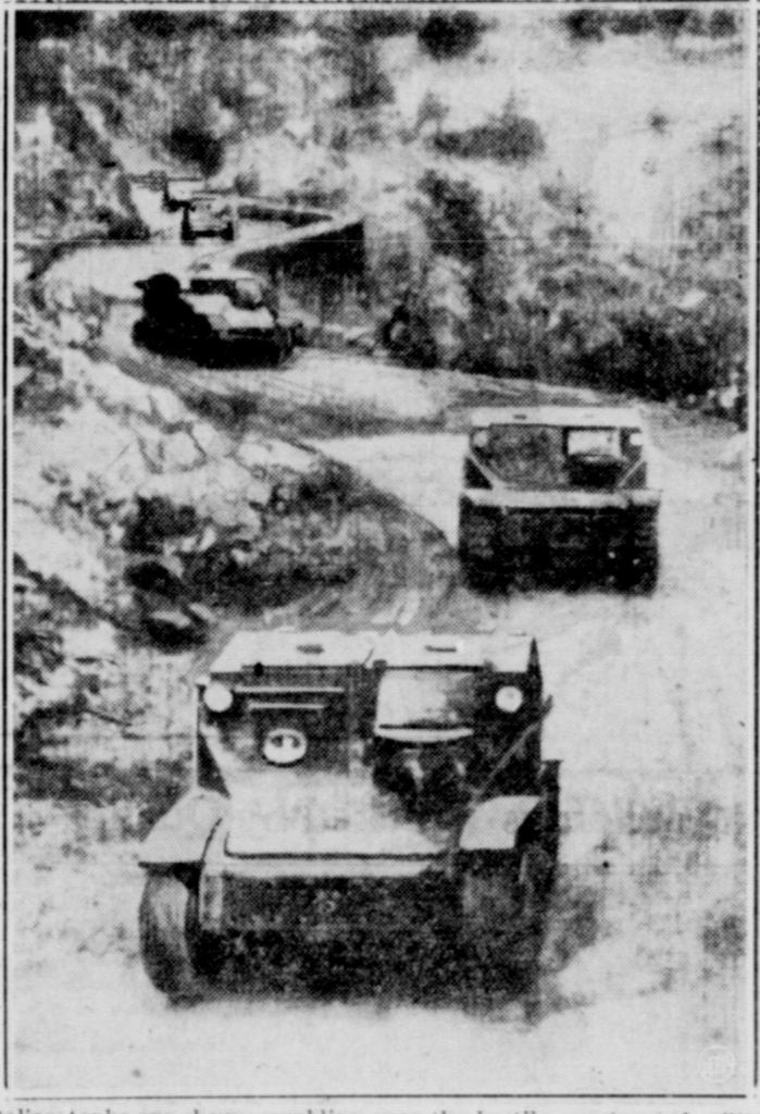
Italian tanks are shown rumbering over the hastily constructed military road to Aksum, enroute to conquest of the Ethiopian holy city, which quickly capitulated.