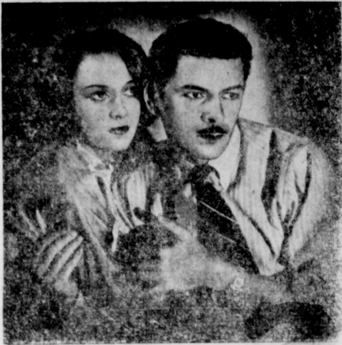
SCENE FROM "DR. SOCATES"