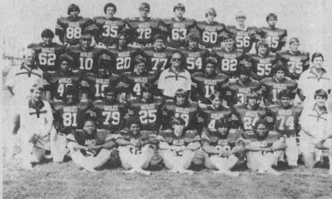
VARSITY MULES.... The Mules opened season play against the Portales Rams Friday night at Greyhound Stadium. There are 35 Varsity Mules.