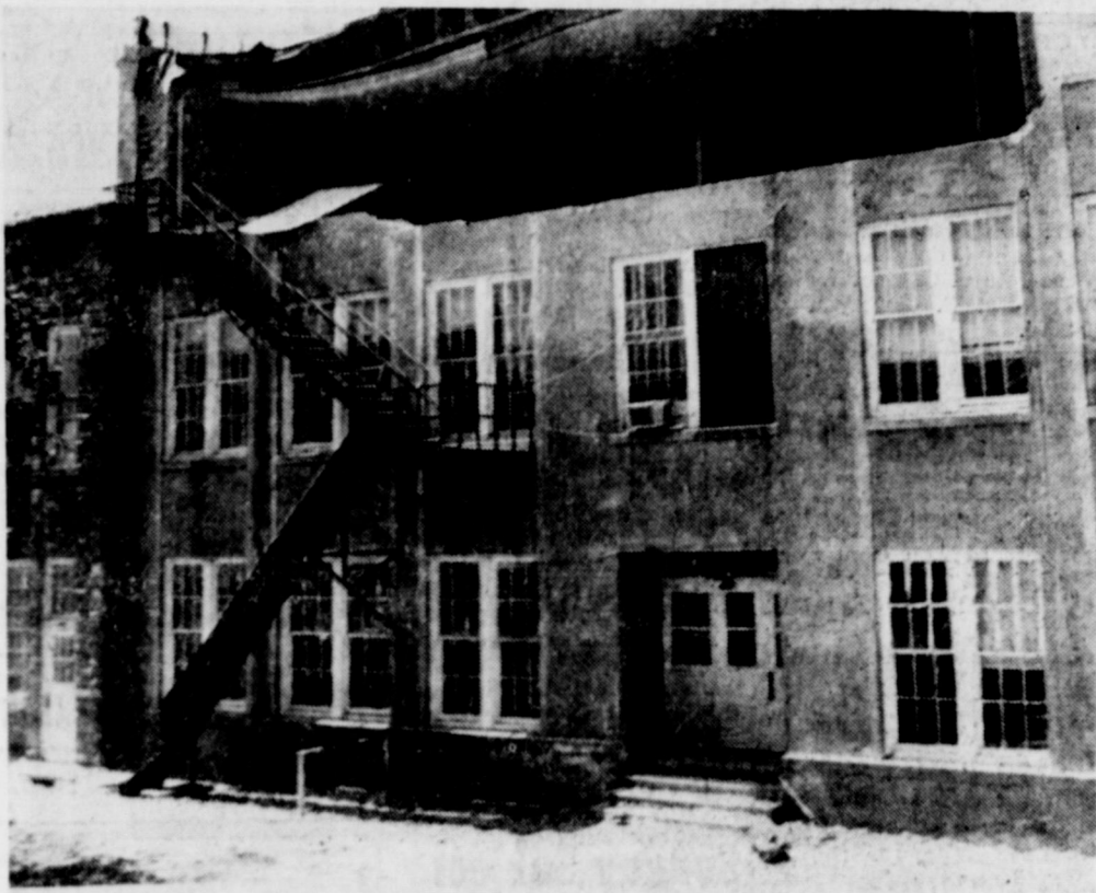
$100,000 LOSS —This photo shows some of the damage to the Carbon School building done by a windstorm Wednesday night. One wall of the upper story was blown out. An assessment of the damage by an engineer found the building still safe for occupancy and classes were expected to resume Monday after temporary repairs.