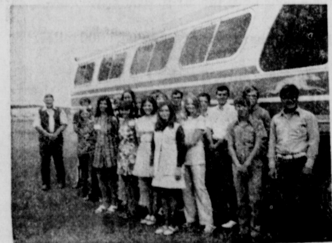
F.B. GROUP HAS COKE BREAK IN EASTLAND