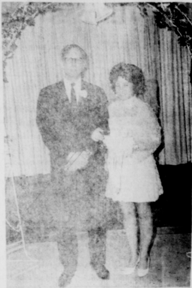
knit suit with brown trim and brown accessories. Her corsage was of carnations.

The mother of the bride wore a brocade suit with pink accessories and light beige carnation corsage. The mother of the groom wore a beige