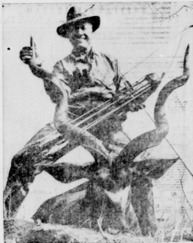
Happy hunter Wally Taber smiles over the first greater kudu ever bagged by civilized man with bow and arrow. In "Safari Moja" opening Oct. 23 at the Majestic theatre, the producer-star shows how it was done.