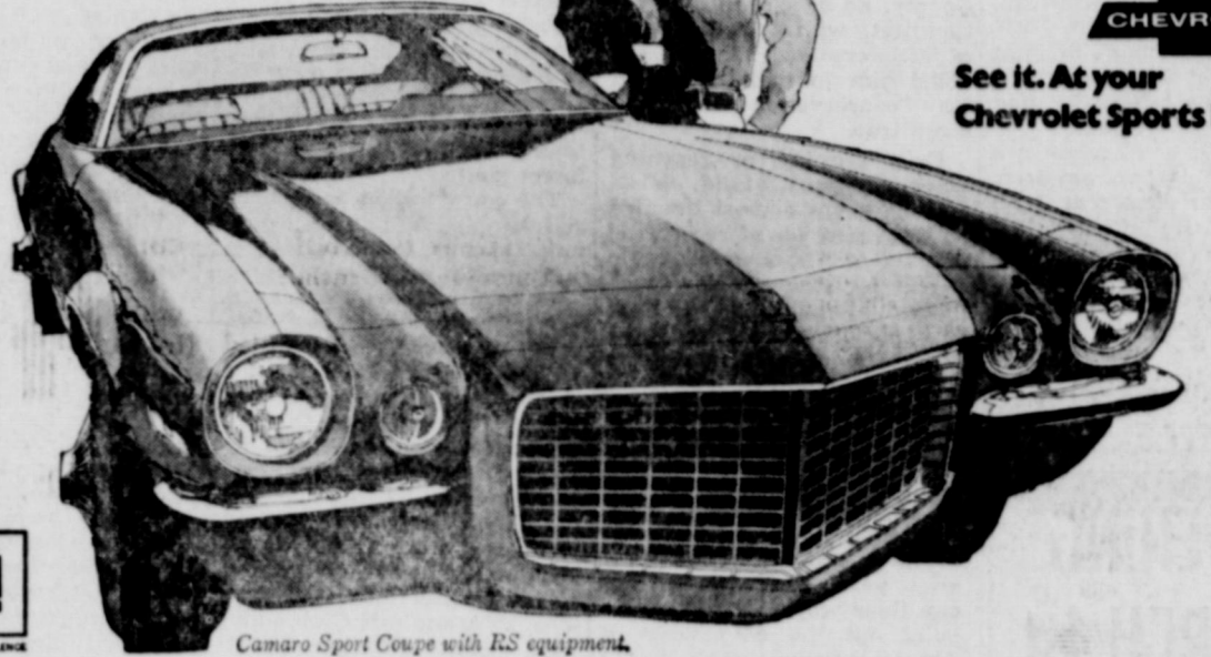
Camaro Sport Coupe with RS equipment.