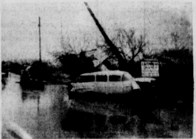
Wreck Scene on East Main St.

Eastland Jaycees will serve as honarary pallbearers.