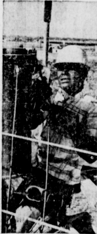
Dependable service . . .

Sec. 2. The foregoing constitutional amendment shall be submitted to a vote of the qualified electors of this state at an election to be held on the first Tuesday after the first Monday in November, 1970, at which election the ballots shall be printed to provide for voting for or against the proposition: "The constitutional amendment authorizing any county, on the vote of a majority of its qualified property taxpayers voting thereon, to issue road bonds in an amount not to exceed one-fourth of the assessed valuation of the real property in the county."