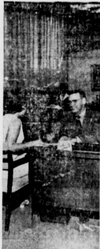
listening to customers . . .