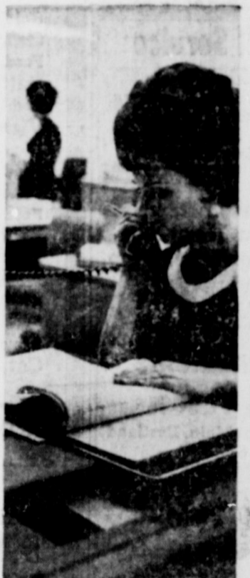
finding answers . . .