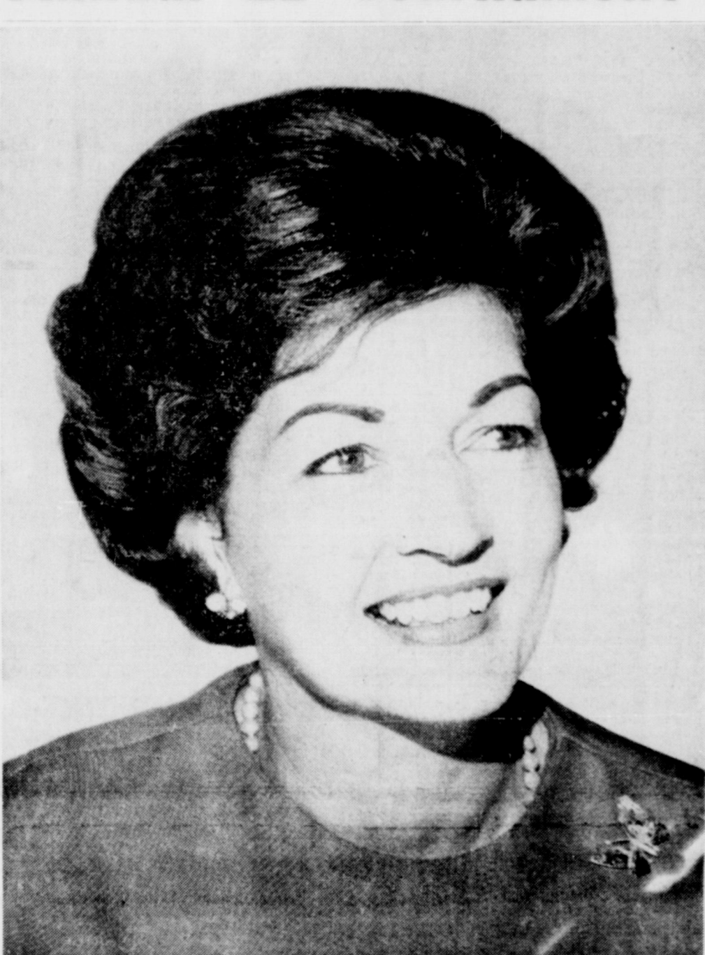
MRS. LLOYD BENTSEN