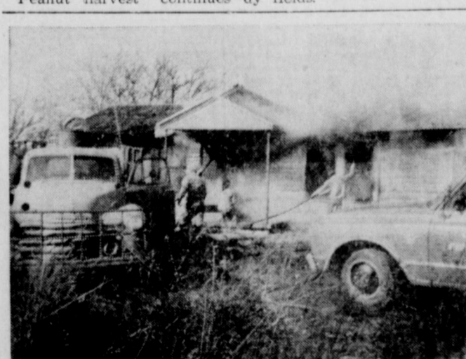
CISCO FIREMEN fight diligently against heavy odds — 40 mile an hour winds — Wednesday in an attempt to save a dwelling alongside Highway 80 midway between Cisco and Eastland. The unoccupied house reportedly caught when bone-dry grassland surrounding it caught fire. Major grassfires were out of control south of Highway 80, and units from both Cisco and Eastland Fire Dept's. were on hand trying to extinguish the blazes. The fire spread across the highway in the powerful south wind and ignited land there.

have reported better yields than last year, but most are reporting lower yields. Yields on irrigated peanuts have been very good while dry land yields have fluctuated considerably. Several farmers had lower yields caused by salt damage in irrigated peanuts this year. Generally the dry land grades are down. Peanut harvest continues