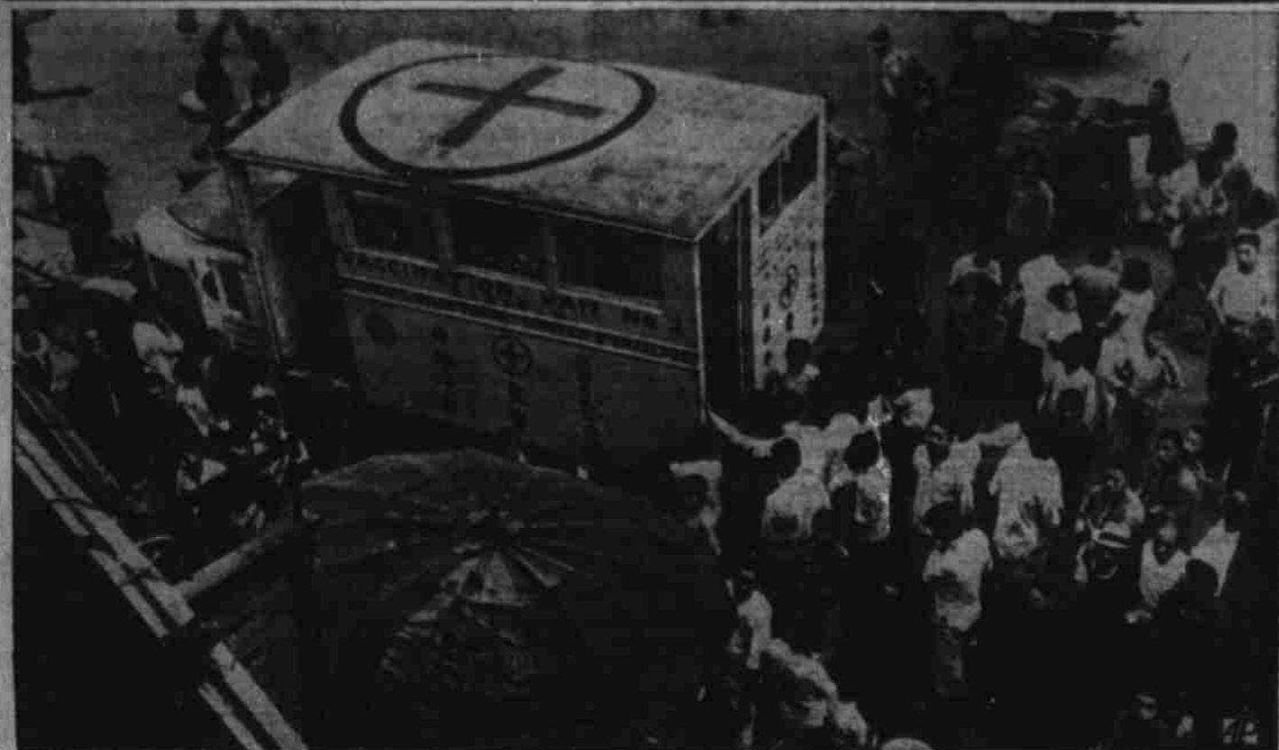
SHANGHAI STILL FIGHTS THE WAR but it's a war against disease. In the International Settlement of Japan-controlled Shanghai, people are herded through vaccination vans like this one and given "shots" for cholera and smallpox.