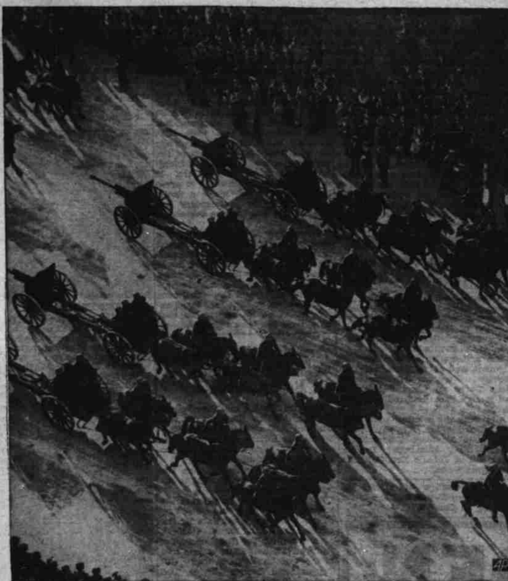
TWENTIETH CENTURY ARMAMENT is needed for a nation "born" in the sixteenth century, military experts in Argentina have decided as they strengthen aerial, artillery and tank branches of the service. These new artillery pieces, bought in France, as well as new tanks purchased in England, figured in a recent celebration in Buenos Aires, capital city.