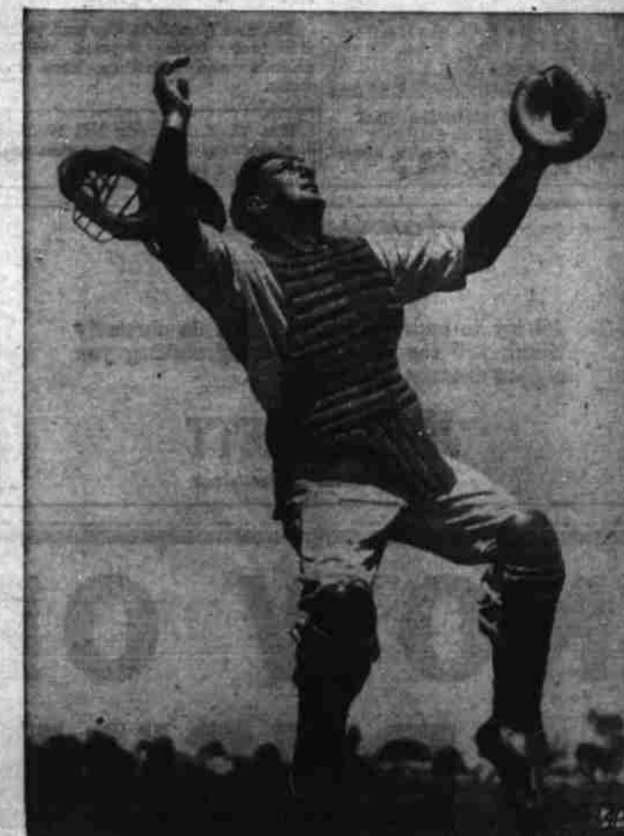
HE CATCHES and he hits—does Ernie Lombardi, Cincinnati Reds' catcher who hit top in National League batting