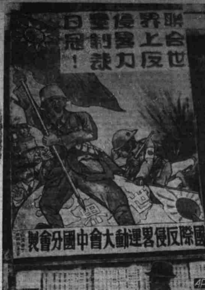
UNCLE SAM AND JOHN BULL have a place (left) on this Chinese poster exhorting the nation to fight for self-preservation. The poster, one of many urging unity against Japan, has the figures representing United States and England standing by ineffectively while a belligerent China rallies the world against what it considers "a Japanese Menace."