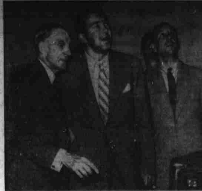
SPEED-LOVING Prince Bertil of Sweden who drove an auto 83 miles an hour around River Rouge plant's proving ground track, slowed down to hear Henry Ford (left) describe historic details of Ford's early American village, Greenfield.