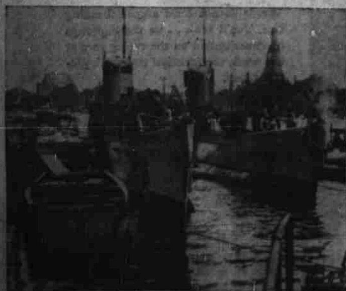
SIAM'S NEW 'SUBS.' built for that country by Japan, were tied up (above) at Royal landing in Bangkok, where a rousing welcome for the submarines was staged. In all, four "subs" were delivered and inspected by officers.