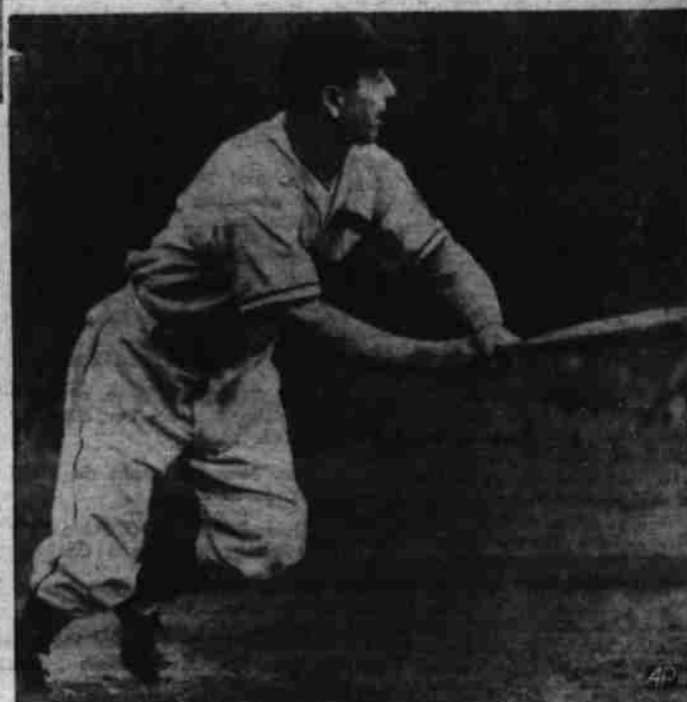
TAKE AN EXPERT'S TIP , here's how to top American League batting. This is Earl Averill of Cleveland Indians.