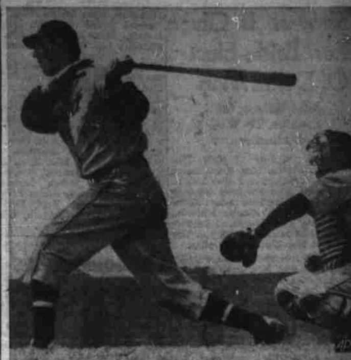
THE HOME-RUN PARADE has Hank Greenberg, Detroit Tigers' infielder, among its front-rank marchers.