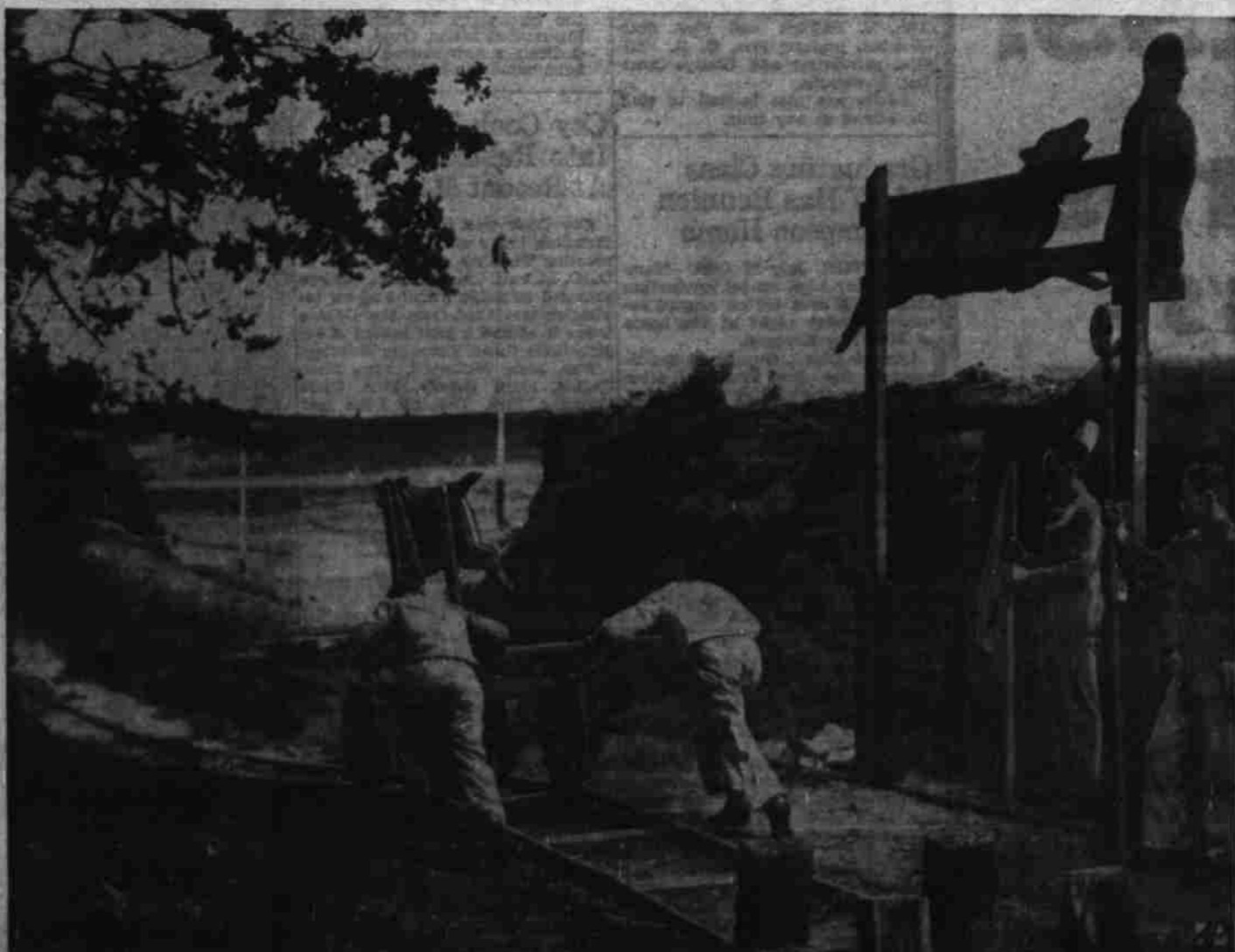
FLEETNESS OF THE DEER is translated into four-wheeled trolley car at England's famous Hides shoot in Surrey where above "running deer" target sweeps along at good pace. The deer is a favorite with marksmen who prefer "big game" hunting.