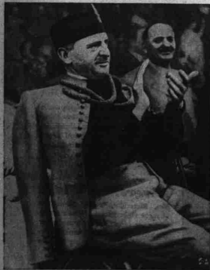
GIVING THEM A HAND , Praha's lord mayor, Peter Mach, is being welcomed by 100,000 Czech athletes.