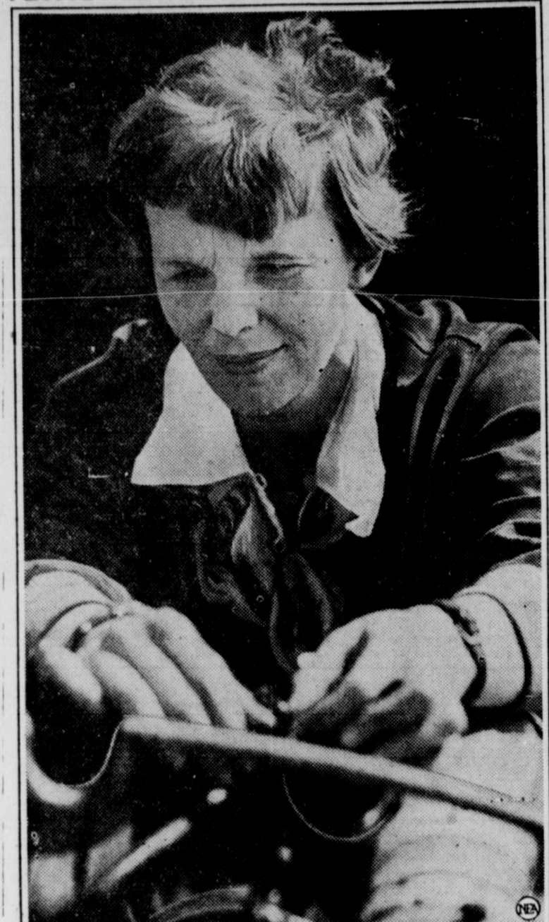
With grave intensity and concentration, these eagle-eyes are fixed on the motor whose correct overhaul may mean new speed records or life itself. They are the eyes of Amelia Earhart Putnam, No. 1 birdwoman of the U. S. A., who is shown here in a camera study which well reveals the character in the intent face below the famous windblown bob.