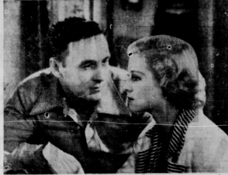
GEORGE O'BRIEN, as a "tough tenderfoot" from the east, finds IRENE HERVEY at an Arizona ranch house—which is one good reason why he stays right there. The eastern chap dons chaps and wags the girl right from under a cattle rustler's nose. All this happens in George's newest Fox release, "The Dude Ranger," written for him by Zane Grey, world-famous author. 2PD