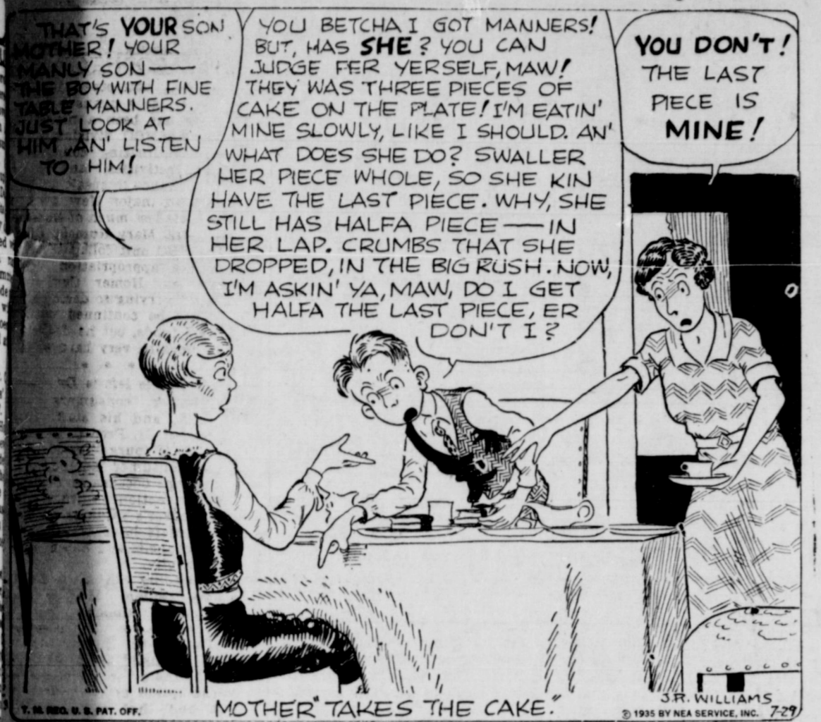
MOTHER TAKES THE CAKE.