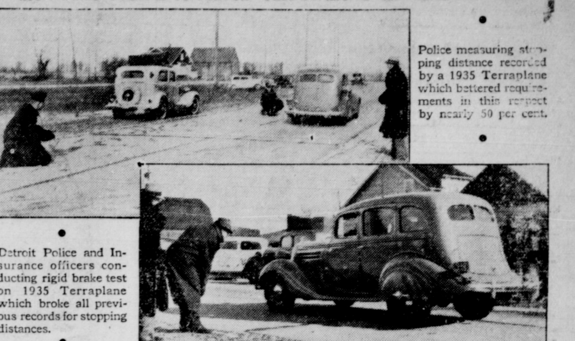
Police measuring stopping distance recorded by a 1935 Terraplane which bettered requirements in this respect by nearly 50 per cent.

Detroit Police and Insurance officers conducting rigid brake test on 1935 Terraplane which broke all previous records for stopping distances.