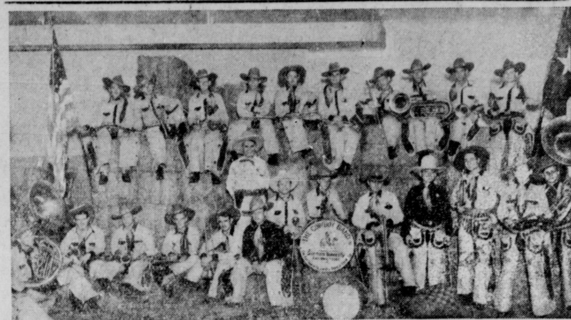
The internationally famous Cowboy Band of Hardin-Simmons University leaves Abilene June 16th over the Texas and Pacific Railway enroute to New York where they embark for Europe.