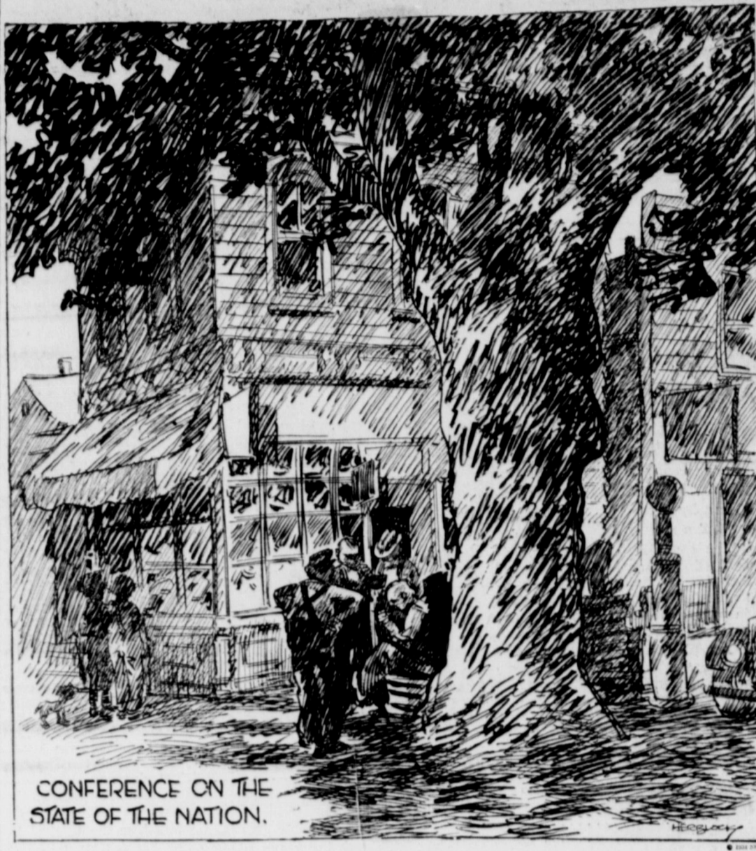
CONFERENCE ON THE STATE OF THE NATION.