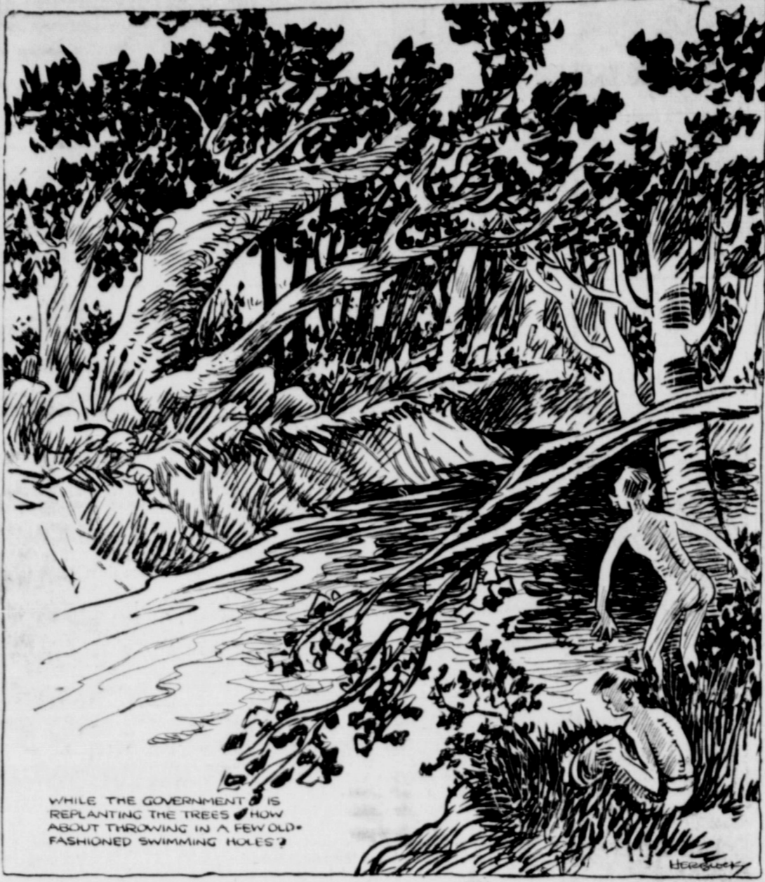
WHILE THE GOVERNMENT IS REPLANTING THE TREES HOW ABOUT THROWING IN A FEW OLD FASHIONED SWIMMING HOLES?