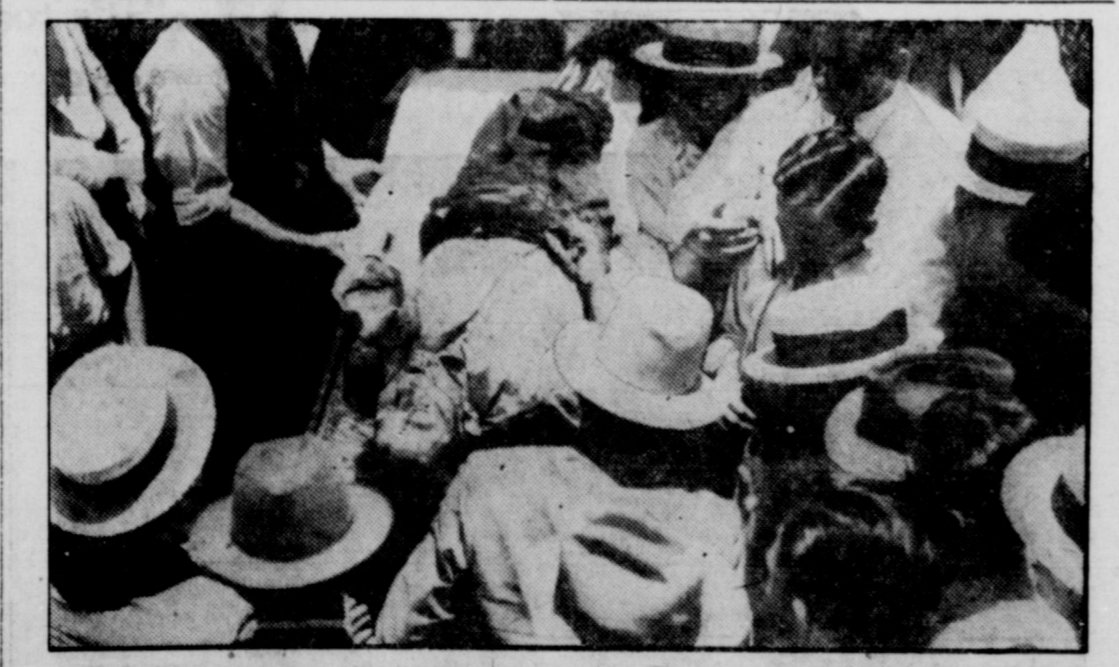
Clyde Barrow went to his death grabbing for a sawed-off shotgun, but before he could bring his weapon into play effectively he went down with approximately 60 bullet wounds in his body. This picture shows him being taken from the death car.