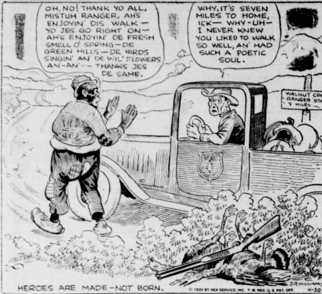
HEROES ARE MADE - NOT BORN.