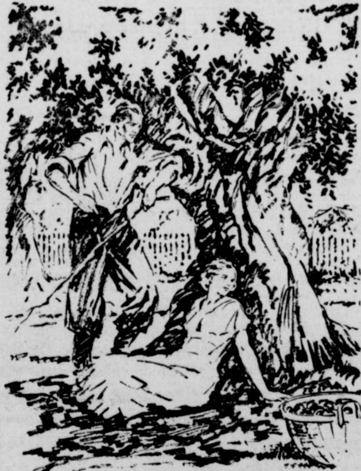
"I haven't seen Grandfather this morning," Donna said.