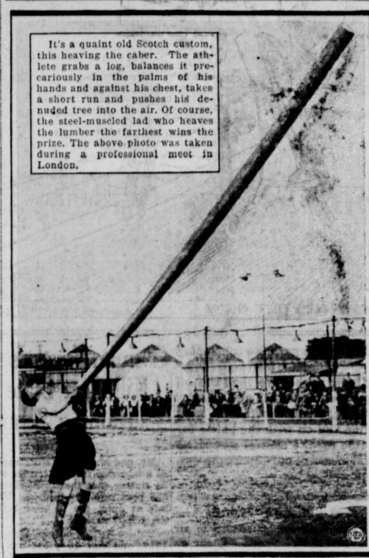
It's a quaint old Scotch custom, this heaving the caber. The athlete grabs a log, balances it precariously in the palms of his hands and against his chest, takes a short run and pushes his denuded tree into the air. Of course, the steel-muscled lad who heaves the lumber the farthest wins the prize. The above photo was taken during a professional meet in London.