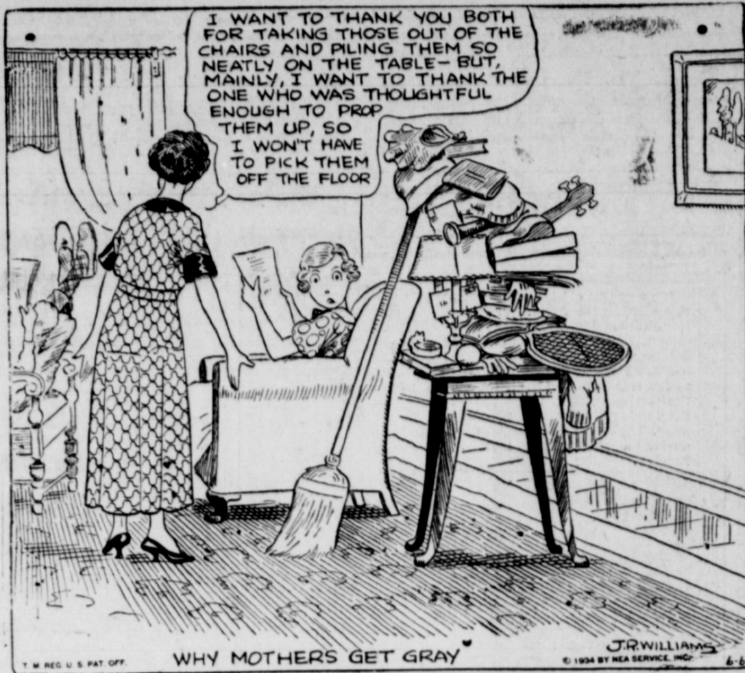
WHY MOTHERS GET GRAY

day production in the sole interest of a gasoline consuming north and east. . . .