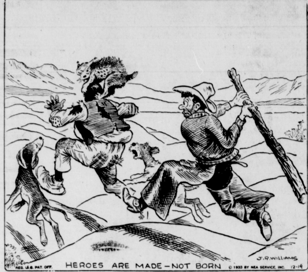
HEROES ARE MADE—NOT BORN