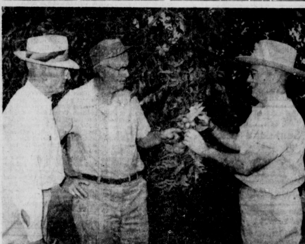
Those figures look good, and if you ask any of those boys why they all have the same answer: "What a line, we've got up there."