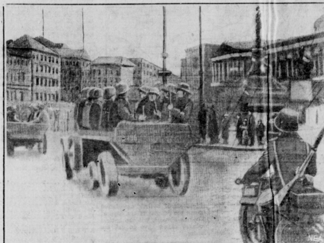
Vienna's gay streets resounded with the grim rumbles of army trucks when, as shown in this radio-photo, heavily armed Heimwehr troops rushed to suppress the Socialist uprising. This picture, taken as civil war gripped the Austrian capital, was flown to London and then transmitted by radio to NEA Service.