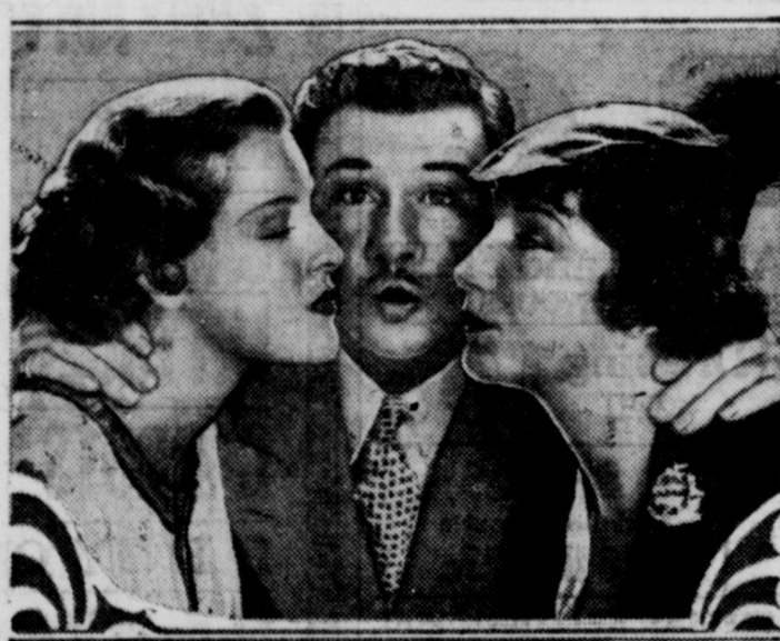
George Bancroft with Frances Dee and Judith Anderson in "Blood Money"