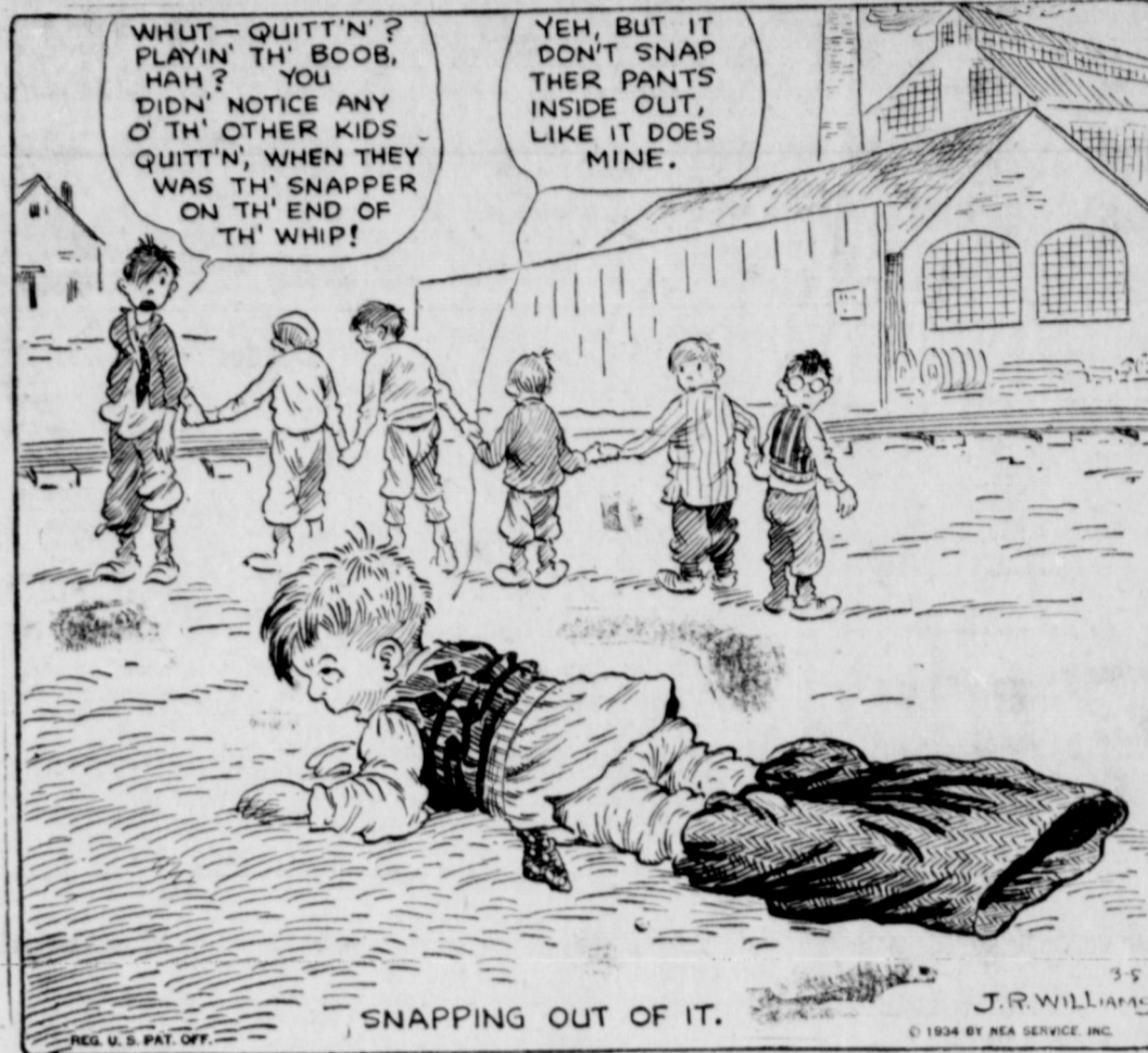
The Newfangles (Mom 'n' Pop)