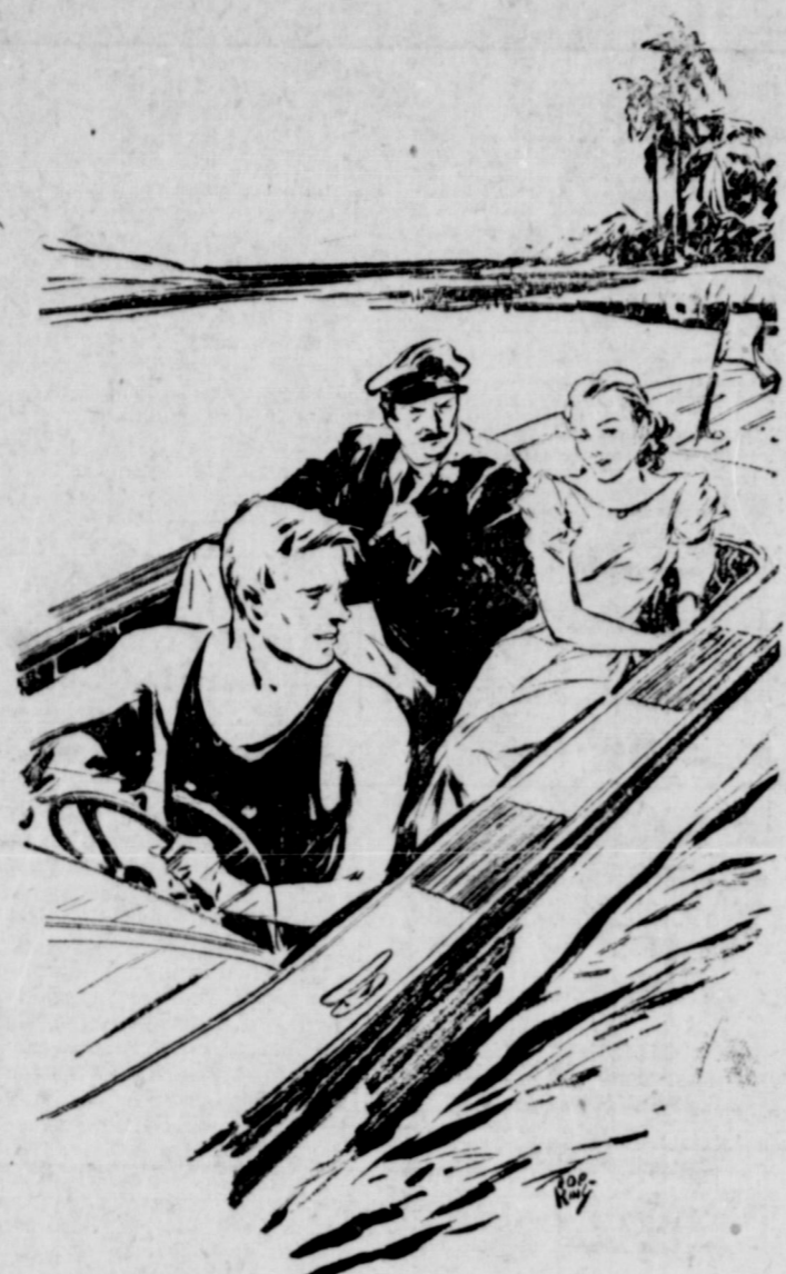
Again and again Pablo found her face turned his way.

Field turned then to go back to the land. Would Estelle go out with her father, Pablo wondered.