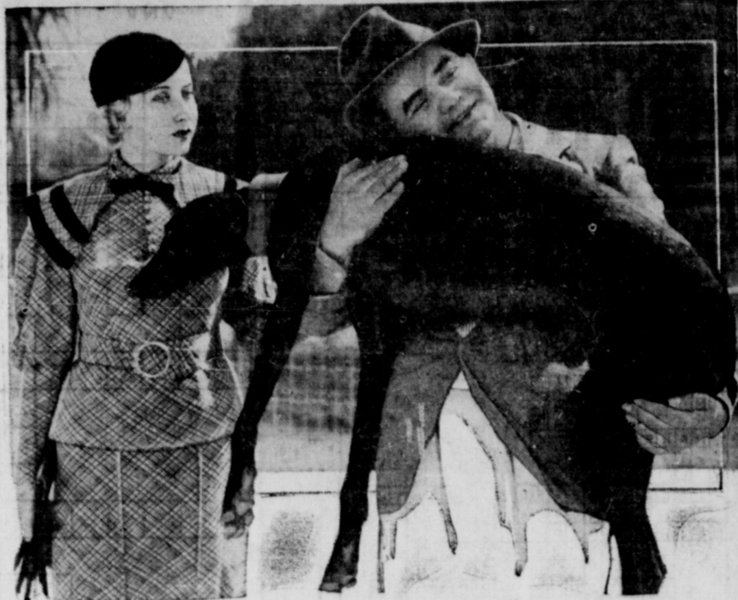
Wonder what causes his peculiar expression on Genevieve Tobin's face as Edward G. Robinson expresses his admiration and affection for his pal of the race tracks, Dark Hazard. The stirring First National drama, "Dark Hazard," opens at the Lyric Sunday with an imposing array of stars and an impressive reputation. The picture is taken from W. R. Burnett's best selling novel of the same name.