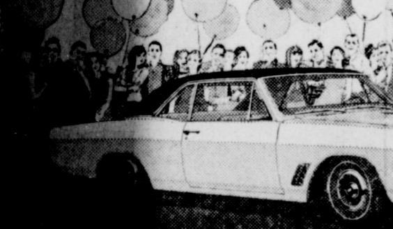
New Special GS. Low-priced. Nice?