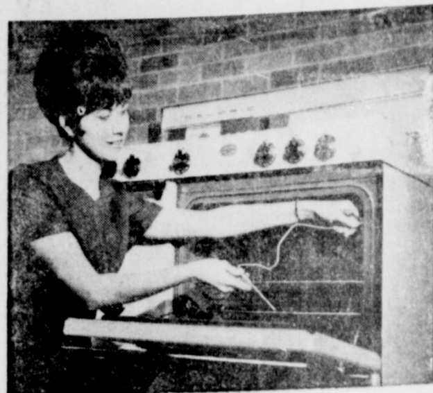
ALL THE GUESSWORK is taken out of cooking a roast with the automatic meat probe, demonstrated on the Caloric range. The meat probe, which is inserted into a cut of meat, controls the roasting of meat to a precise degree of doneness. Lone Star Gas Company is currently conducting a caloric gas range sale.