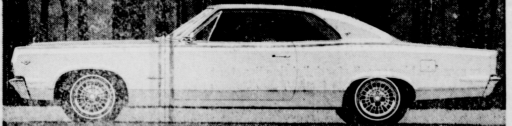
AMBASSADOR Now—full-size luxury cars created for today, priced for the young man who wants his luxury car right now. 118" wheelbase. Interiors now as spacious as the most expensive full-size cars.