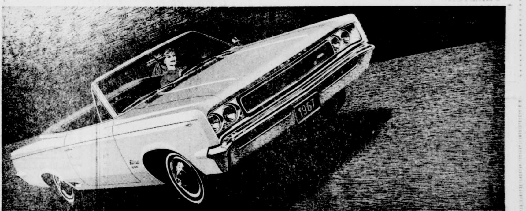
REBEL Now— the first Excitement Machines in the intermediate class! Cars for Now that never existed before! A 114" wheelbase. Excitement that's 197" long, 78" wide, 54" high. More people-space inside than any other cars their size. A choice of five engines, topped by a 343 cu. in. Typhoon V-8. A wide road stance and 4-link rear suspension to glue down corners, untwist curves. An SST convertible (above) that seats 3 in back comfortably. Rebel: SST hardtop and SST convertible; 770 hardtop, sedan, wagon; 550 sedans, wagon.