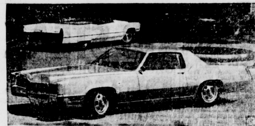
CADILLAC has 12 models for 1967 highlighted by a completely new luxury personal car — the front-wheel-drive Fleetwood Eldorado (foreground). Styling of the other 11 models, including the De Ville Convertible (background), is distinctively different while maintaining the traditional Cadillac "look." The new Cadillacs are on display at Pipkin Motor Co., Eastland.