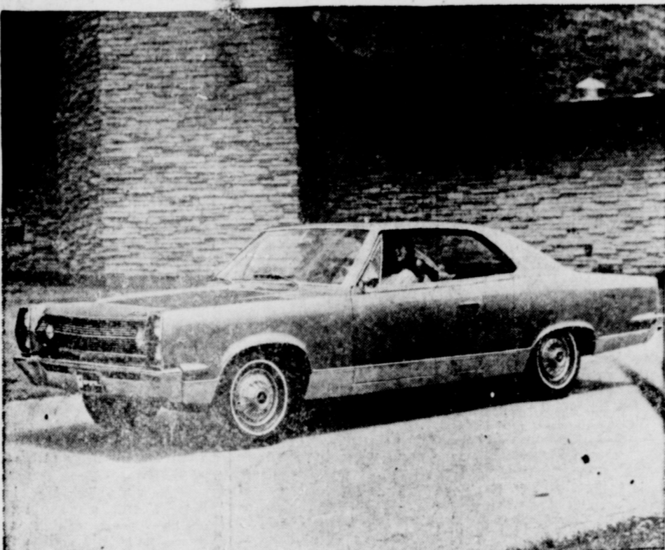
Two "up-sweep" horizontal paint stripes at the belt line add distinction to the all-new 1967 Ambassador DPL hardtop and convertible models. The DPL models also have "rally" turn signal-park lights in the grille instead of in the front bumper to differentiate them from other Ambassador models. The wheelbase of the Ambassador line has been increased from 116 to 118 inches, resulting in an increase of two and one-half inches in over-all length of hardtops, convertible and sedans, and four inches for station wagons, on display at Pipkin Motor, Co., Eastland.

A 232 cubic inch six rated at 145 horsepower.