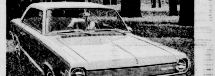
RAMBLER AMERICAN Now—Typhoon V-8 thunder comes to the low priced economy champs. Two Typhoon V-8s; three big 6's. America's only complete line of compacts: Rogue hardtop (above), convertible; 440 sedans, hardtop, wagon; 220 sedans, wagon.