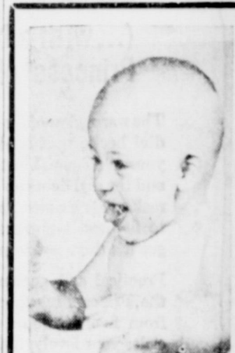
"Phaft! Taste my mother-in-law's stew." However, he does it tastes like the medications my buys for us. We carry a stock of children's supplies, children's aspirin, and make children's medicine instead of giving it. We use the baby oils, soaps, and brushes that mother needs. Baby comfortable and happy. Even diaper training pants! Make our store your "DEPOT" for all baby-care needs.