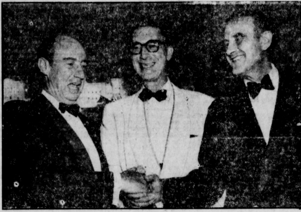
HE QUILTS—Top gladiators in the Democratic arena at Chicago, Adlai Stevenson, left, Estes Kefauver, center, and Gov. Averell Harriman of New York, call a friendly armistice in the battle for the Democratic Presidential nomination. Kefauver pulled out of the fight this week and asked his supporters to lend their weight to Stevenson.