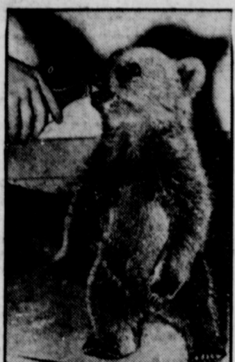
BEAR DIPLOMACY — "Nikki," Russian bear cub, tastes British hospitality at the zoo in London, England, where he'll receive royal treatment from now on. He was a gift to Princess Anne from Soviets' party chief Khrushchev and Premier Bulganin on occasion of their recent visit to Great Britain.