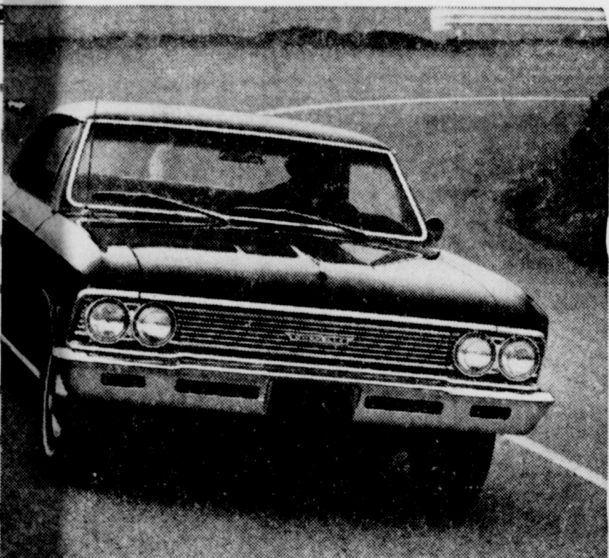
Malibu Sport Coupe—with eight new standard safety features, including outside rearview mirror, shatter-resistant inside mirror. Always check both mirrors before pulling out to pass.

Way people snapping up buys on Chevelle V8's & Sport Chevrolet dealer's... and think they're really getting away with something.