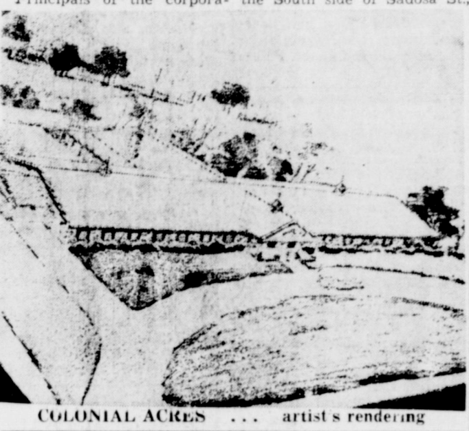
COLONIAL ACRES . . . artist's rendering