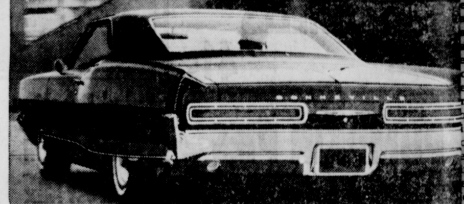
This is our luxury tiger.

What's new in tiger country? What did you have in mind?