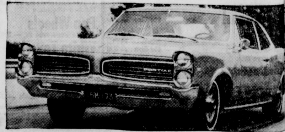
This is our economy tiger

There are 38 more tigers in between—all Wide-Tracks, all Pontiacs!