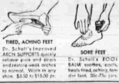
TIRED, ACHING FEET

Dr. Scholl's Improved ARCH SUPPORTS quickly relieve pain and strain and restore weak arches to normal. Worn in any shoe. $3.50 to $15.00 pr.