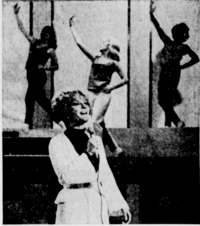
That "Downtown" Girl Petula Clark sings it and other song hits that have made her famous on television and Warner Brothers Records when she stars in American International's "The Big T. N. T. Show," as the late show at the Majestic Theater on Saturday night. Also starring in the musical variety show are David McCallum, Joan Baez, Roger Miller and others.