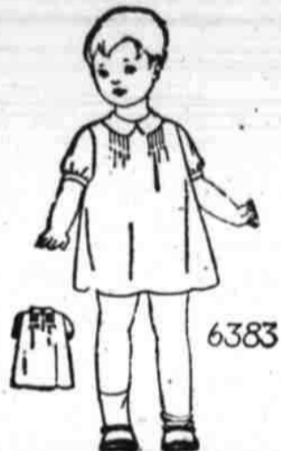
A DAINTY DRESS FOR A TINY GIRL

6383. Batiste or dimity could be selected for this model. The tucks may be hand run or stitched on the machine. A decoration of fine embroidery or feather-stitching would be nice on this dress. Crepe de chine or China silk, zephyr or voile are also suggested. The sleeve is gathered to a sleeve band. This band may be omitted, and the sleeve finished with a heading of fine narrow lace, with which the collar also may be trimmed. The pattern for this little dress is cut in 4 sizes: 6 months, 1 year, 2 and 3 years. To make the dress for a 1 year size will require 1 3/4 yard of 32 inch material. Pattern mailed to any address