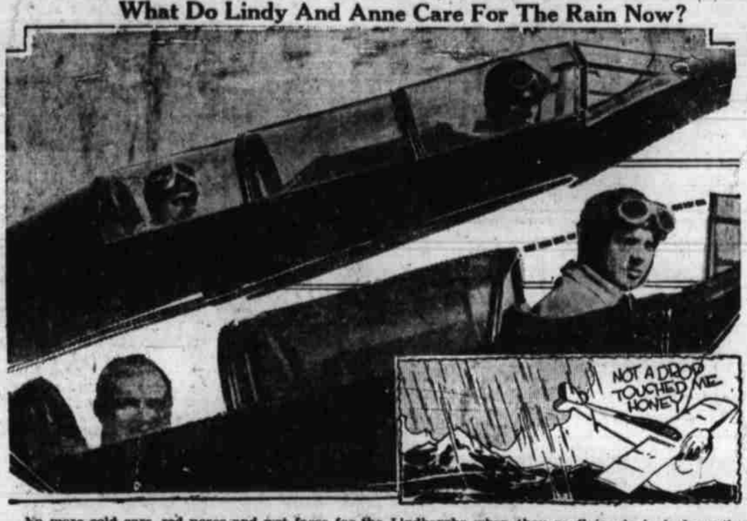
What Do Lindy And Anne Care For The Rain Now? No more cold ears, red noses and wet faces for the Lindberghs when they go flying in in bad weather, for here's the "coupe top" that the colonel has just installed on their new monoplane at Los Angeles...