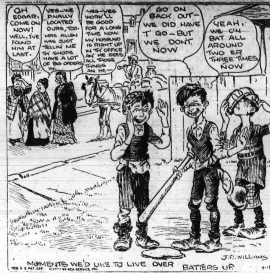
MOMENTS WE'D LIKE TO LIVE OVER BATTERS UP