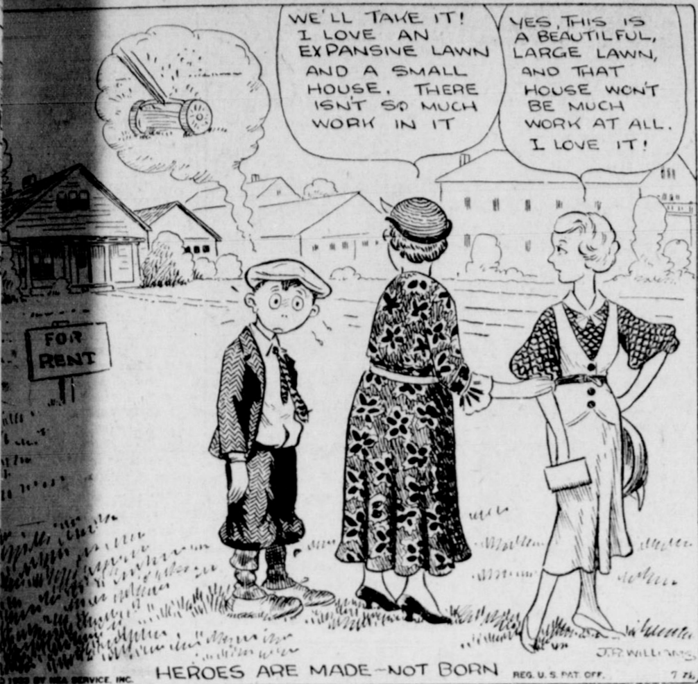
HEROES ARE MADE—NOT BORN