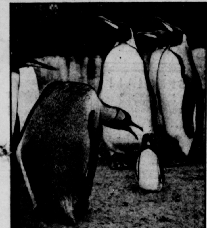
"NOW, YOU LISTEN TO ME"—There's nothing that irritates a stuffed shirt more than another stuffed shirt. Irate King penguin in the London, England zoo, isn't telling off baby. He's voicing his indignation at an impostor—a toy penguin—which was slipped into the cage. Other members of the soup-'n'-fish set, background, are ignoring the whole thing.

C rations were issued to the troops for the Saturday evening meal and Sunday morning. The problem was secured about midnight Saturday and the troops bivouaced in the field for the night.