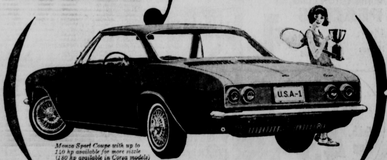
Monza Sport Coupe with up to 110 hp available for more sizzle (180 hp available in Corsa models)